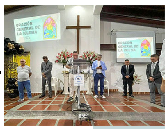
The anniversary celebration in Medellin, Colombia

We thank God for his continued guidance and blessing, allowing <u>Luteranos Confesionales Colombia</u> to share the gospel for 50 years.