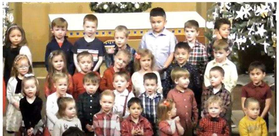
3K and 4K students "Love to Tell the Story" of Jesus' birth at the St. Paul School Children's Christmas Service.

We return to school on January 4, to begin the third quarter of the year. In addition to parent-teacher consultations, January is filled with boys' and girls' basketball games, with home games starting on January 5. Please consider joining us for a game and cheering on your Eagles. You are always welcome. For a complete calendar that includes all of our games, please visit our website.