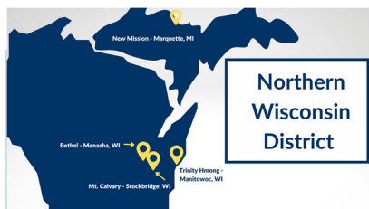
Home Mission congregations in the Northern Wisconsin District